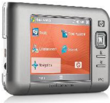
HP 5910 Windows Mobile Computer And GPS